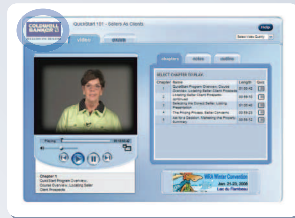
Coldwell Banker Branding